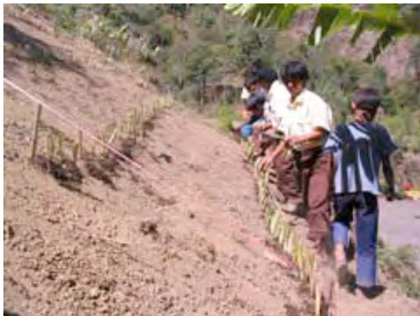
Finished with a wobble!