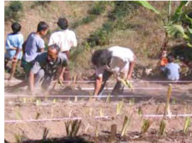
Planting on the 40 degree slopes in soft sand!