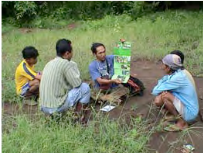
Vetiver posters are a very powerful visual aid