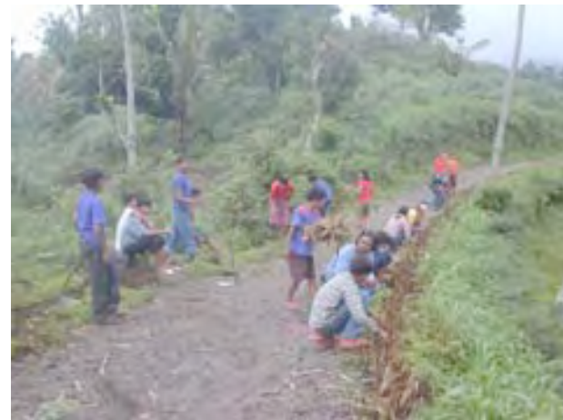
Newly opened road - community plant Vetiver