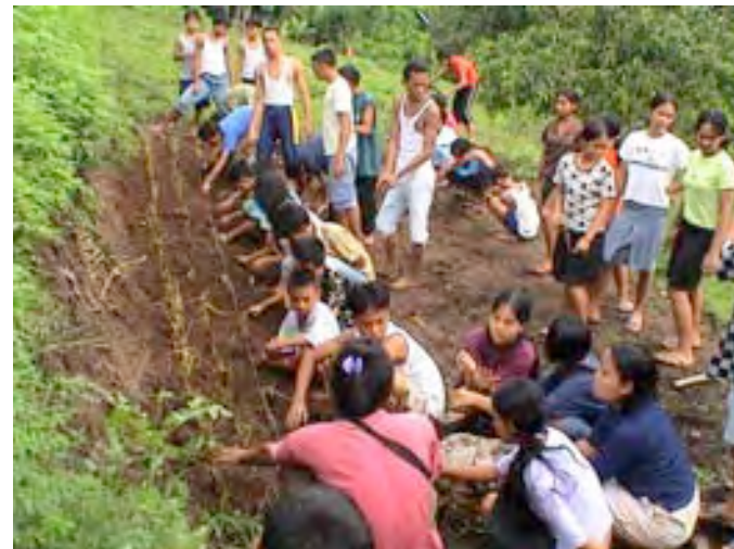
and practice what they learnt on barren school land