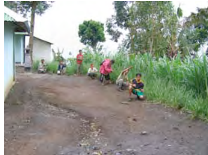
Vetiver at boundary now higher than surrounds!