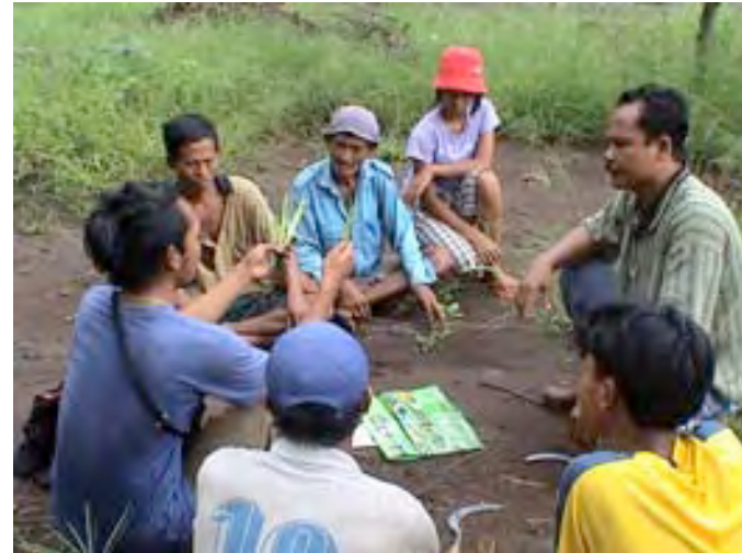
Explaining simple hand measure for slip & root length