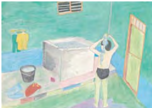
Desa Ban - Jangki, Bali