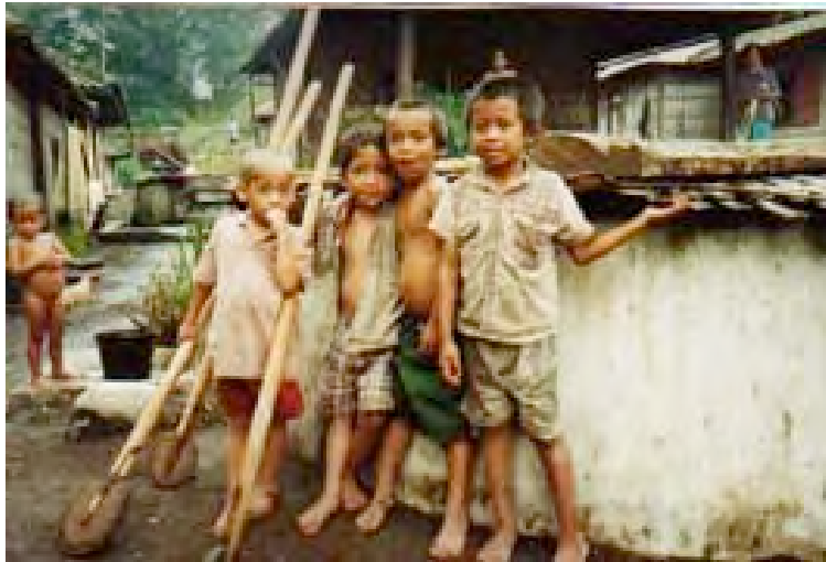
Cegi kids, 1999, before they had a school