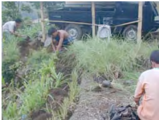
New vetiver at Cegi – pickup in background