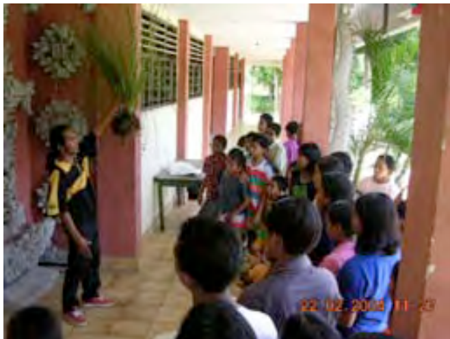
North Bali junior high school children listen.....