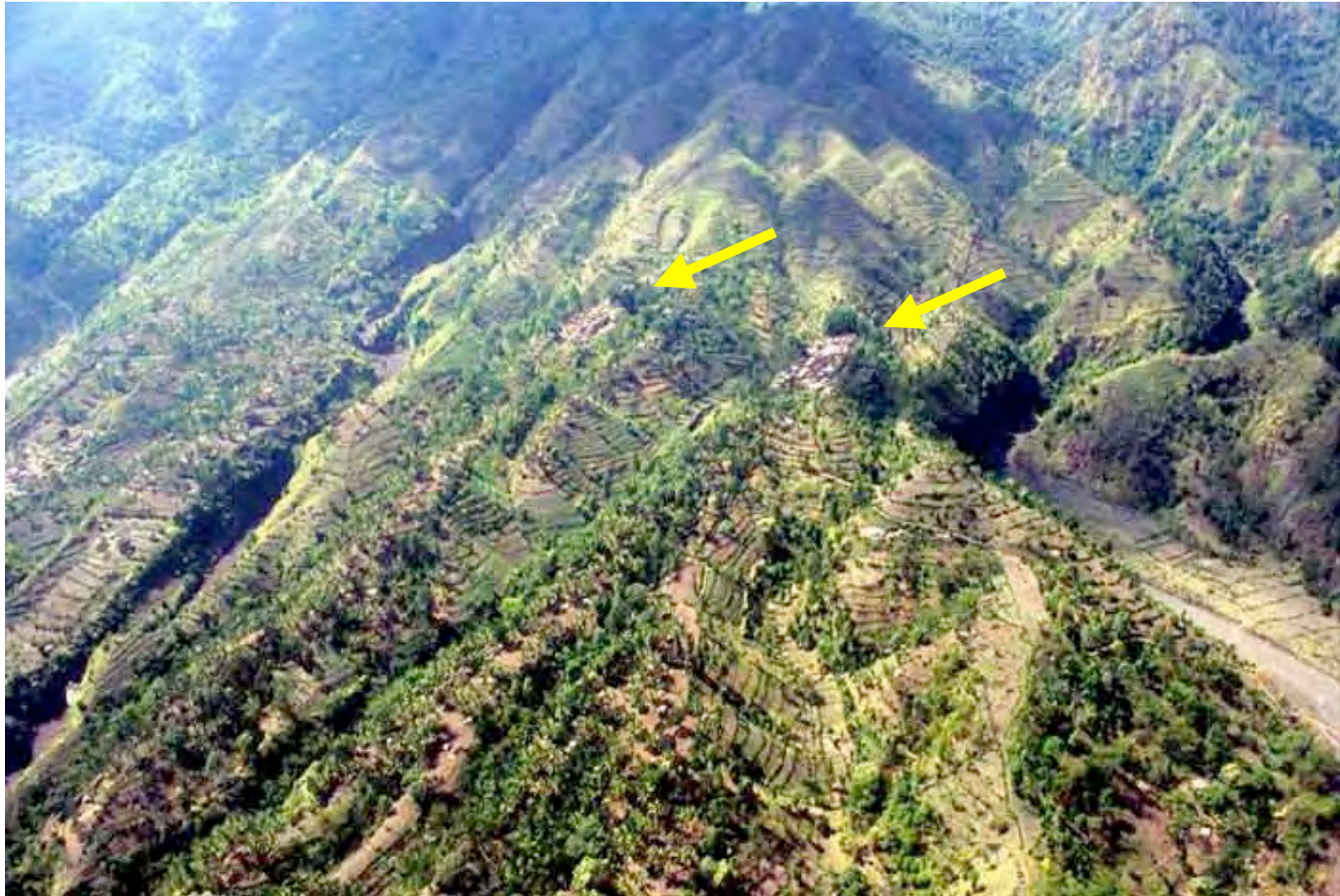
Cegi and Pengalusan hamlets at elevation of 1,100m on Mount Agung slopes