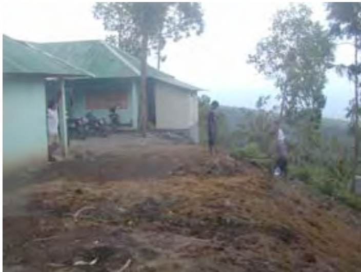
Newly completed Cegi school in June, 2004

Bali Hindu Priest blessing Cegi community land in January 2004 prior to leveling out the hill leading down to Cegi children's organic vegetable garden. The community did not believe that the cut sand from the brow of the hill could form the school foundation as fill as there was no clay or other cohesion in the sand. Vetiver came to the rescue! The power of vetiver in this testing situation sent a clear message throughout the region: "Got a land stabilization problem? No problem If you use vetiver! "