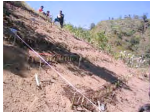
The final judgement