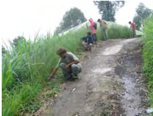
Road to Cegi hamlet: concrete & Vetiver