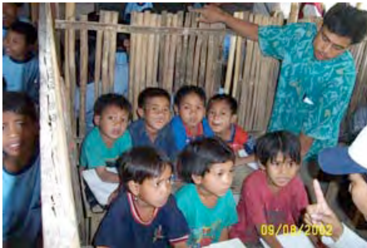
2 nd intake Pengalusan kids 2002 in temp. school