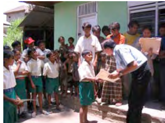
Pengalusan graduates, 2004, at new school