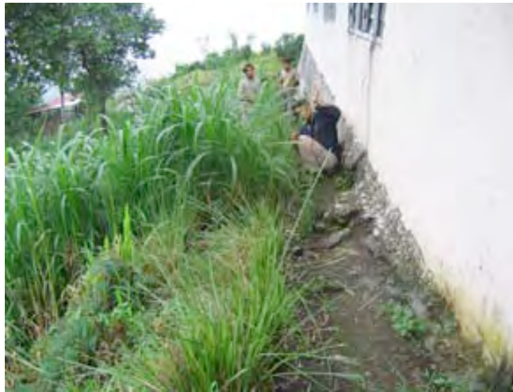
Rear of school has done magnificent job!