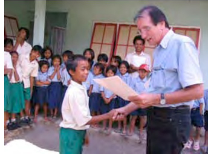
Same kids graduate primary school 2004