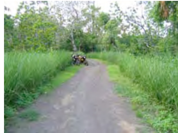
Lush Vetiver borders inter hamlet track