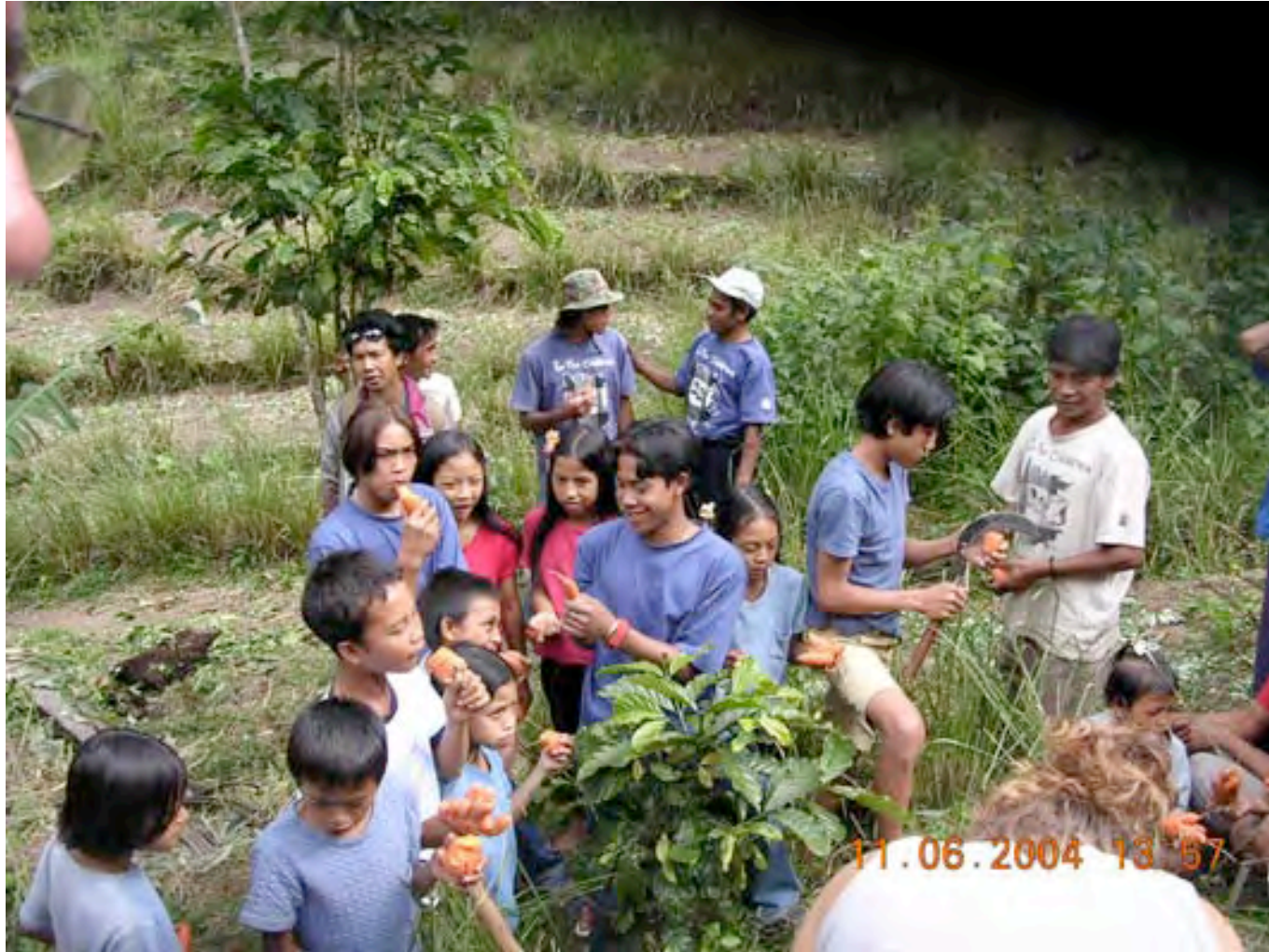
June 2004 Carrot harvest in Bunga (see Vetiver training video)