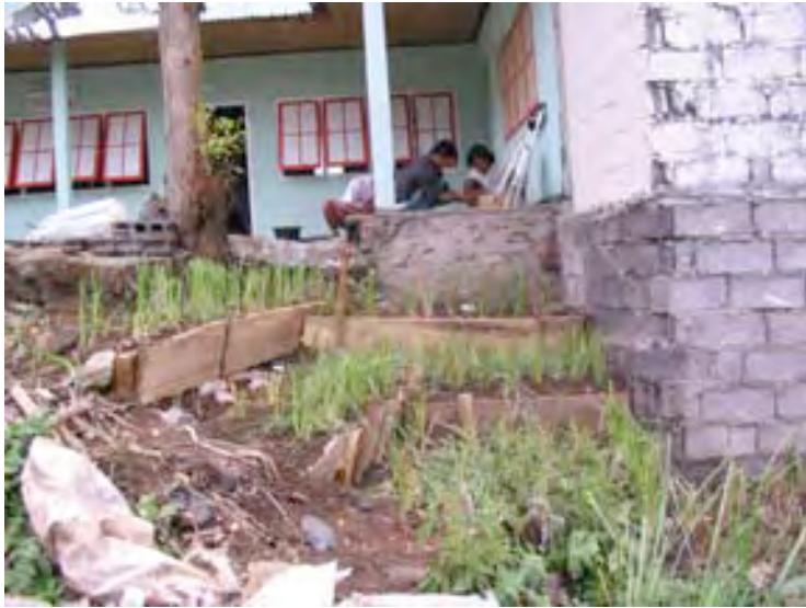
Stepped vetiver to prevent erosion where land drops rapidly - 2004