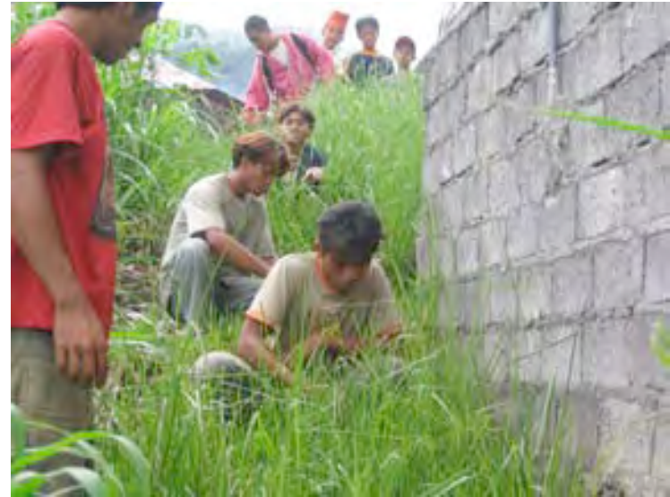
December 2005: Vetiver Has held the land and even collected wind-blown rubbish!