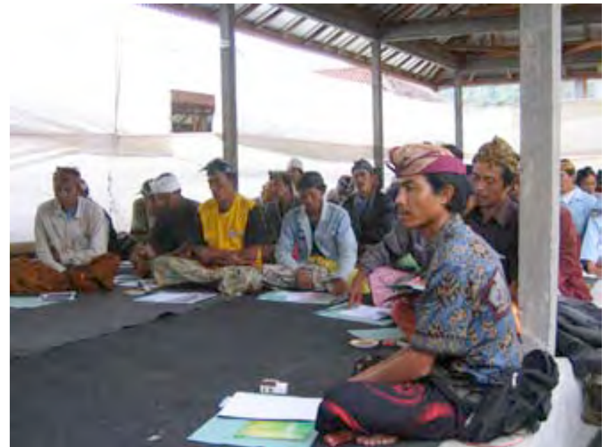
Lake Batur farmers listen intently – prior to field training