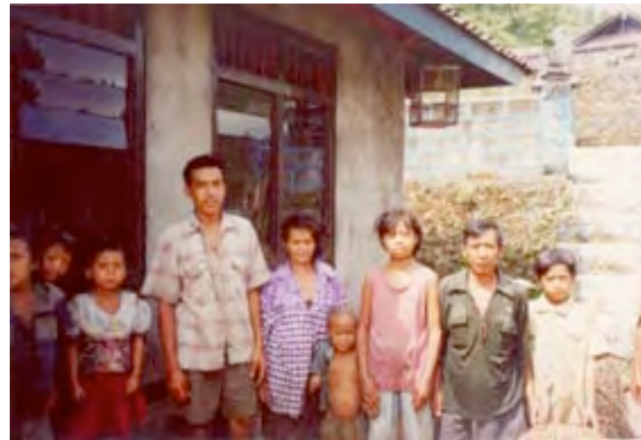
Stunted growth caused by IDD: One non-IDD man!