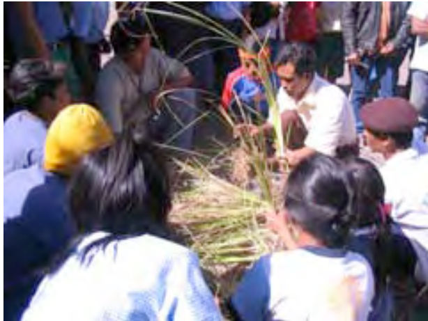
Cutting the Vetiver grass & roots to correct length

A competitive event in EBPP's annual Indonesian Independence Day celebrations, designed to challenge children, parents and communities to prove who is best at what they have learnt for their newly empowered future. Teams of 5 kids and Dads compete to prepare, plant and water vetiver. Points given for accuracy in preparing, planting & watering